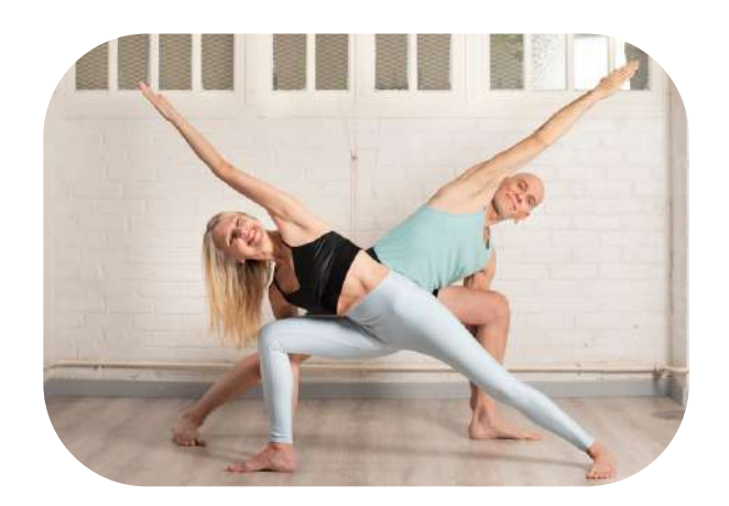
Paris 40 avenue de la République 75011 Paris

Once you have been sent any of the course materials or have been logged onto the site, there will be no refunds.