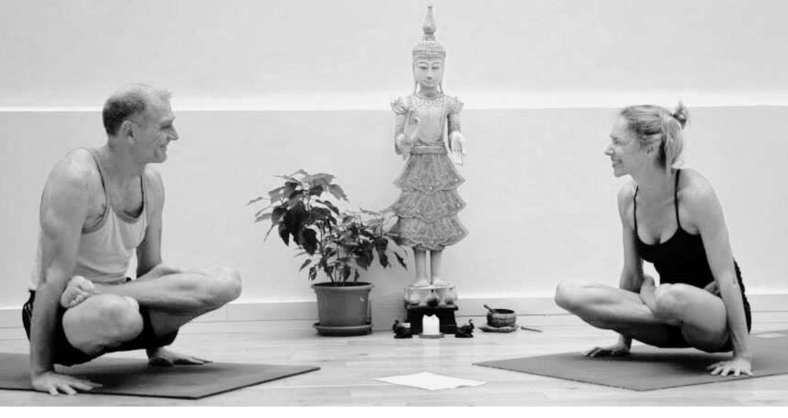
We'd love to hear from you and answer any questions you may have!